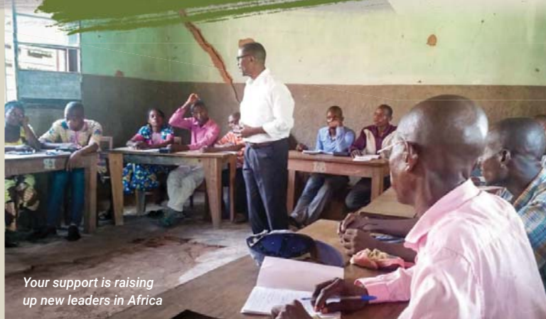
Your support is raising up new leaders in Africa

Last year, with your support and partnership, the African Enterprise Leadership Institute launched two nationally accredited qualification programs in South Africa!