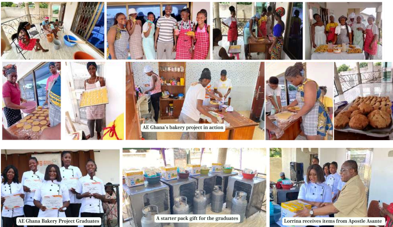
AE Ghana Bakery Project Graduates

We believe that empowering women is crucial to the development of any community. This program speaks volumes about our commitment to creating opportunities for women to learn, grow, and thrive. We are proud of the progress made by the beneficiaries and look forward to seeing their businesses grow and thrive in the future.