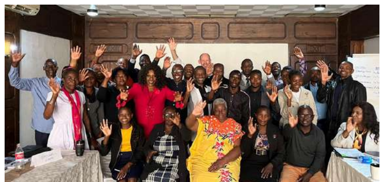
Evangelism Training in preparation for Harare mission, and beyond