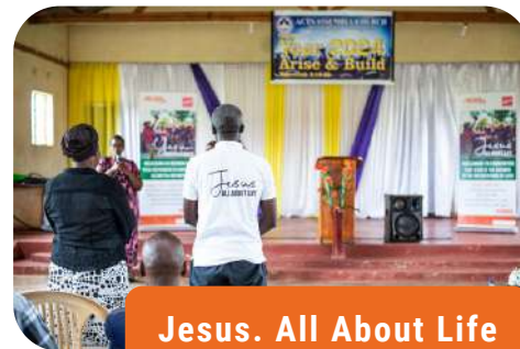
Jesus. All About Life