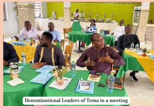
Denominational Leaders of Tema in a meeting