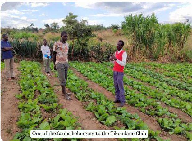
One of the farms belonging to the Tikondane Club