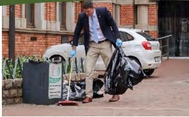
AE South Africa was engaged in city-cleaning as the team took to the streets in a clean-up operation in the vicinity of the Pietermaritzburg City Hall.