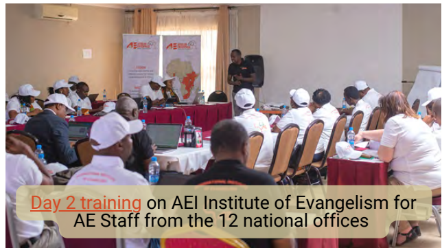
Day 2 training on AEI Institute of Evangelism for AE Staff from the 12 national offices