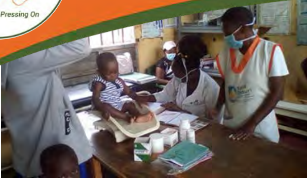
In Kenya , the staff at the AE medical clinic in Soweto, Kayole, spent the afternoon cleaning up the neighbourhood streets around the medical clinic.