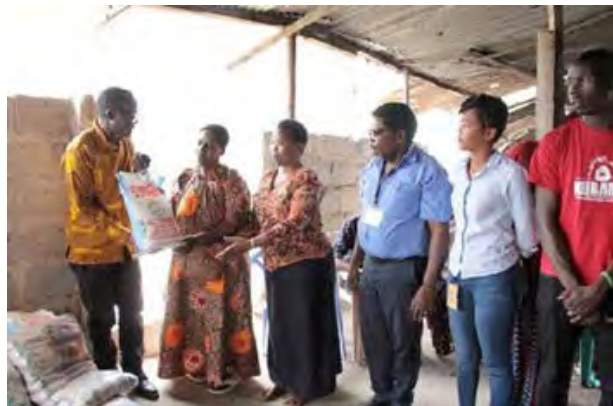
AEE- Tanzania donated 30kgs of wheat, 30 packets of salt, 30kgs of sugar and 30kgs of beans to a widows' group referred to as BIUMA group. 3 Muslim women from the group accepted Christ after The Word was shared to them.