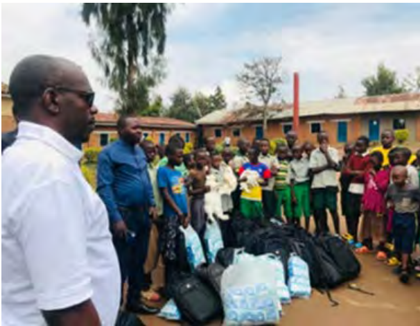
In Gasabo district, of Kigali, Rwanda school materials and rabbits were given to 30 students in Jurwe Primary School. Those students who were selected were considered poverty stricken and less advantaged.