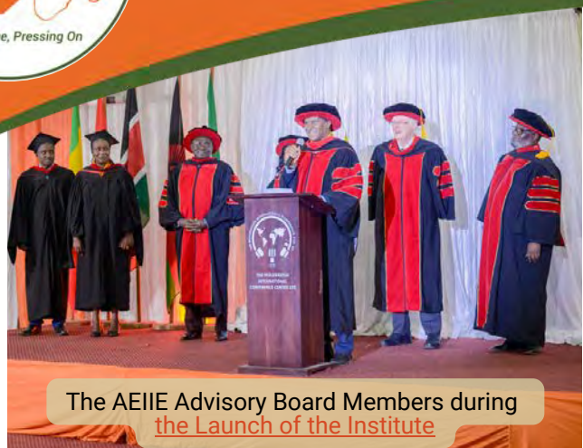
The AEIIE Advisory Board Members during the Launch of the Institute