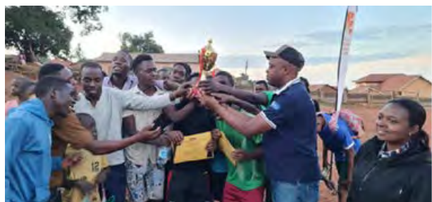
AEE Uganda was involved in Sports Outreach, Medical outreach and Blood donation at The Safe Resilient and Adolescent Youth (SRAY) project at Rubaga division in Kampala.