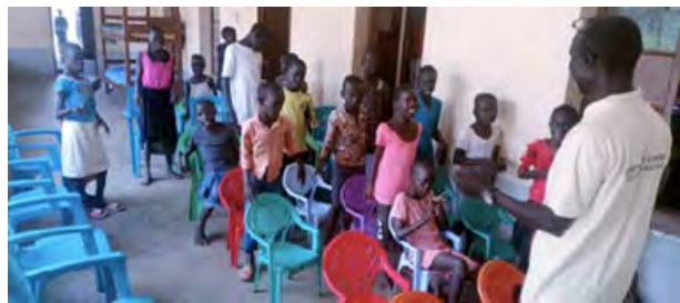
AE South Sudan partnered with Unity Community Transformation Group and Best friends Harvester Group to distribute food donations and offer trauma healing awareness to Juba Orphanage Centre.