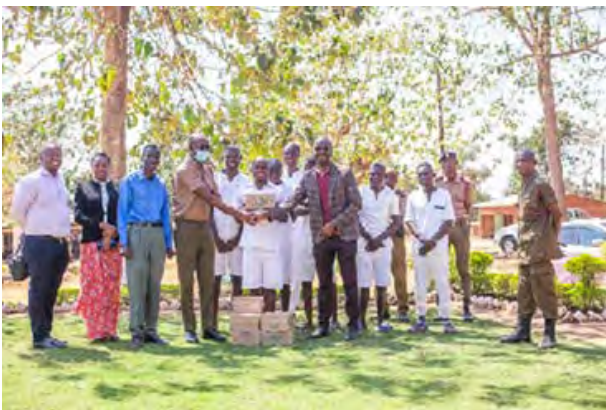
AE Malawi staff visited Maula Prison in Lilongwe, Malawi. 10 cartons of soap were donated to aid in the hygiene demands of the institution.