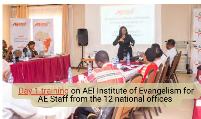
Day 1 training on AEI Institute of Evangelism for AE Staff from the 12 national offices