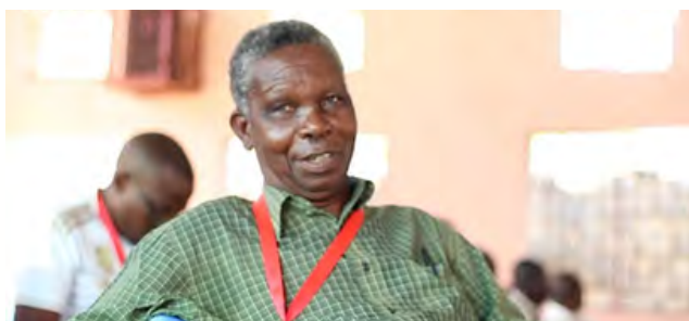
"The Word of God requires the heart not the mind." - Boastz Kaputa