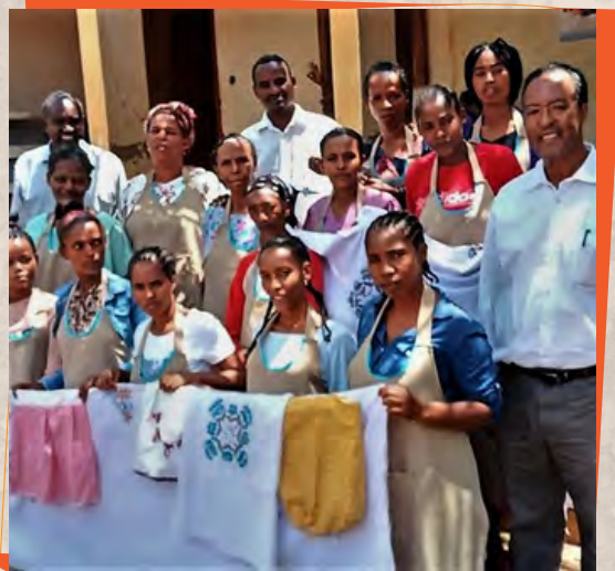
Ethiopia Sewing Project Trainees