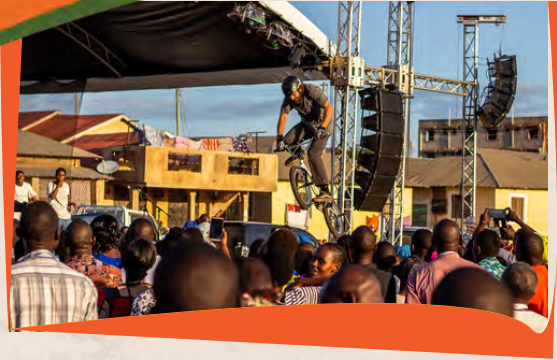
Bike Stunts during the Reach Mombasa Festival