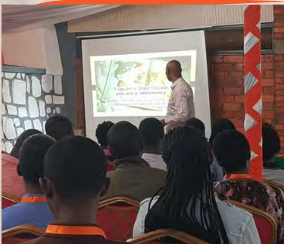
AEE Rwanda Missional Life Seminar Training