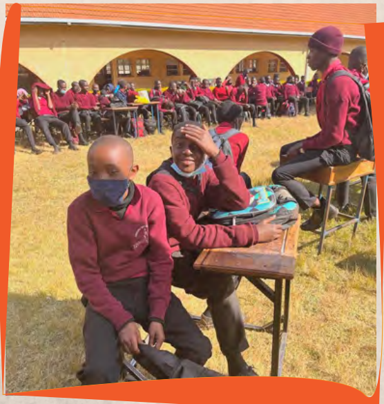
In preparing for the Lusaka Mission 2022, the AESAR Team got an early response to visit a prominent all Boys Government Secondary School