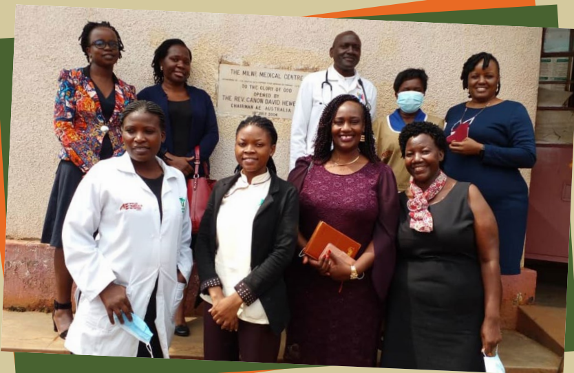
International Social Action Director with some staff in Uganda during a recent project monitoring visit.