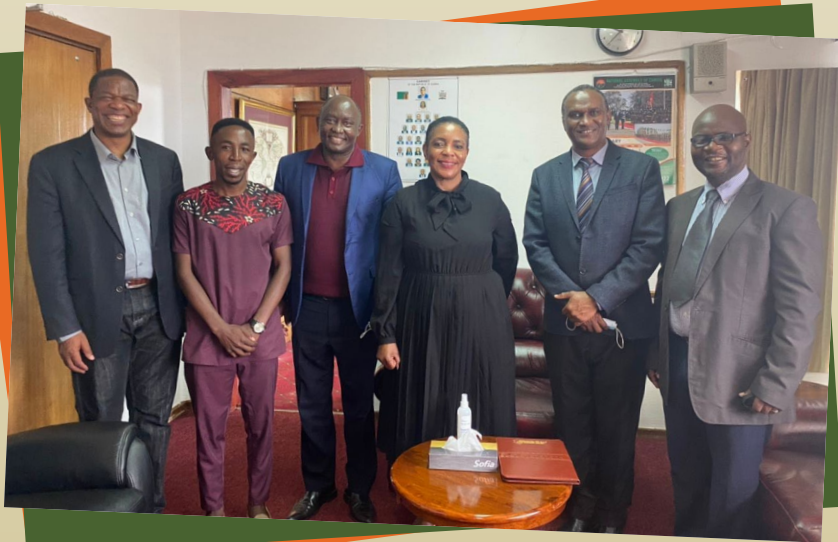
AE Team with the Speaker of the Zambian National Assembly, Right Honorable Nelly Mutti, at her office.