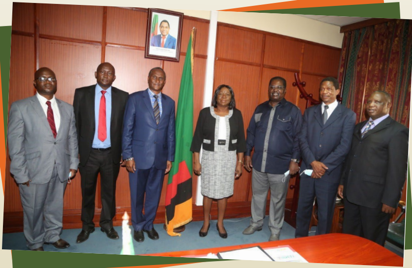
AE Team posing with the Zambian Vice President Mrs. Mutale Nalumango after a meeting