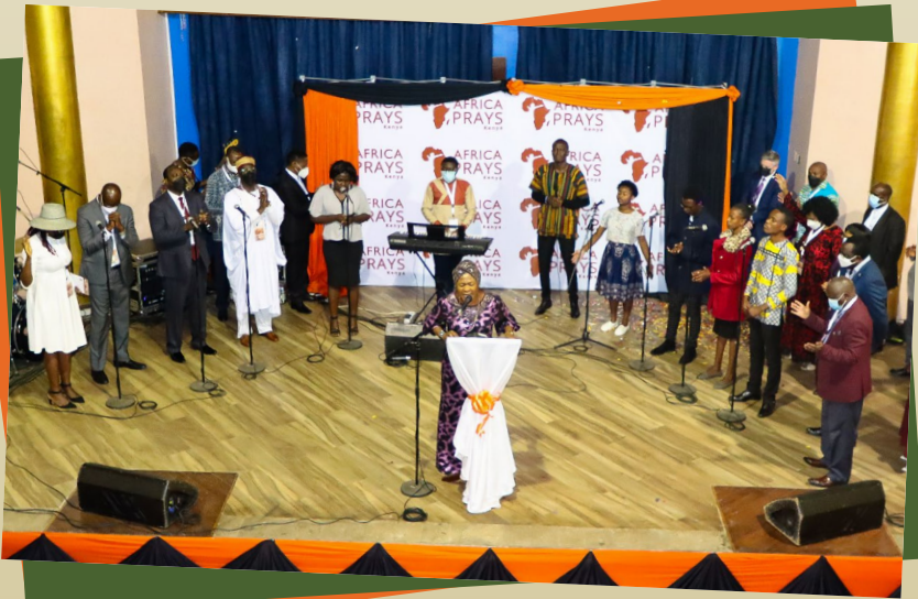
Church leaders during the launch of Africa Prays - Kenya in Nairobi. See the brief HERE .