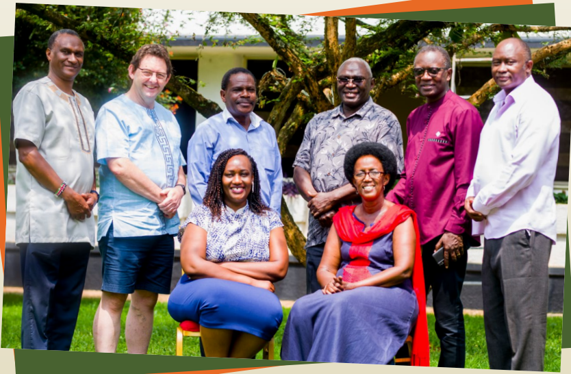
AE International Board during the 2022 Quarter 1 meeting in Uganda