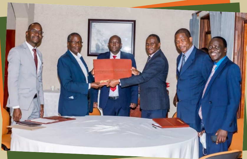
Handover of the Signed Memorandum of Understanding for AE Southern Africa Region in Malawi.