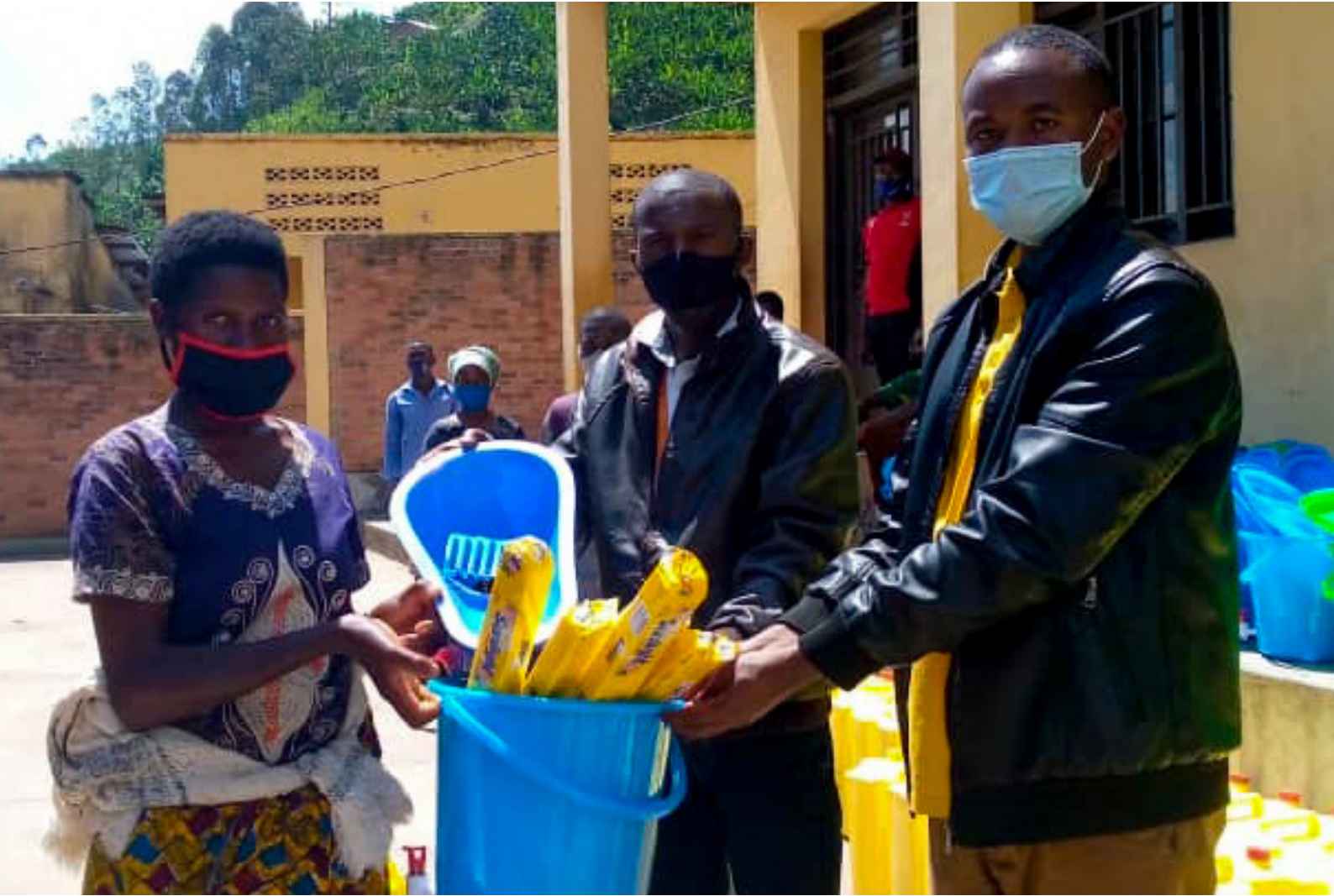
ABOVE: Distribution of Hygiene materials in Shyira in Rwanda BELOW: A team of 20 women currently going through a 6-month sewing training in Ethiopia.