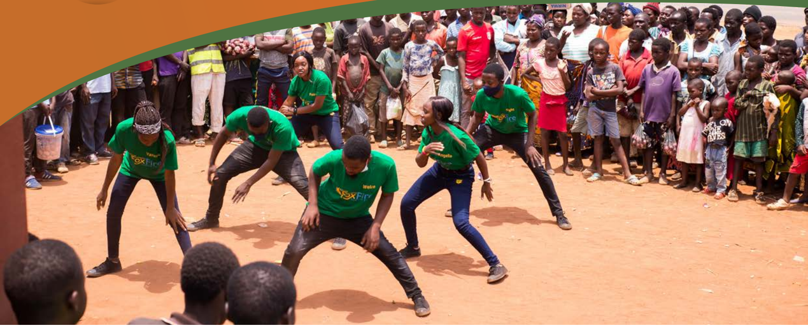
Foxfires ministering through art in an earlier mission [File Photo]