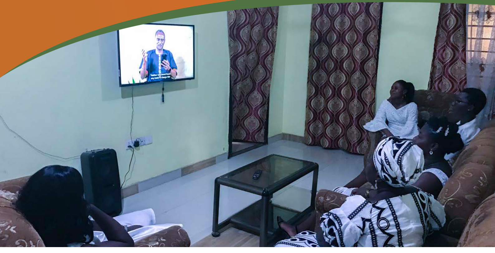
A family watching the Good Friday Broadcast in Ghana